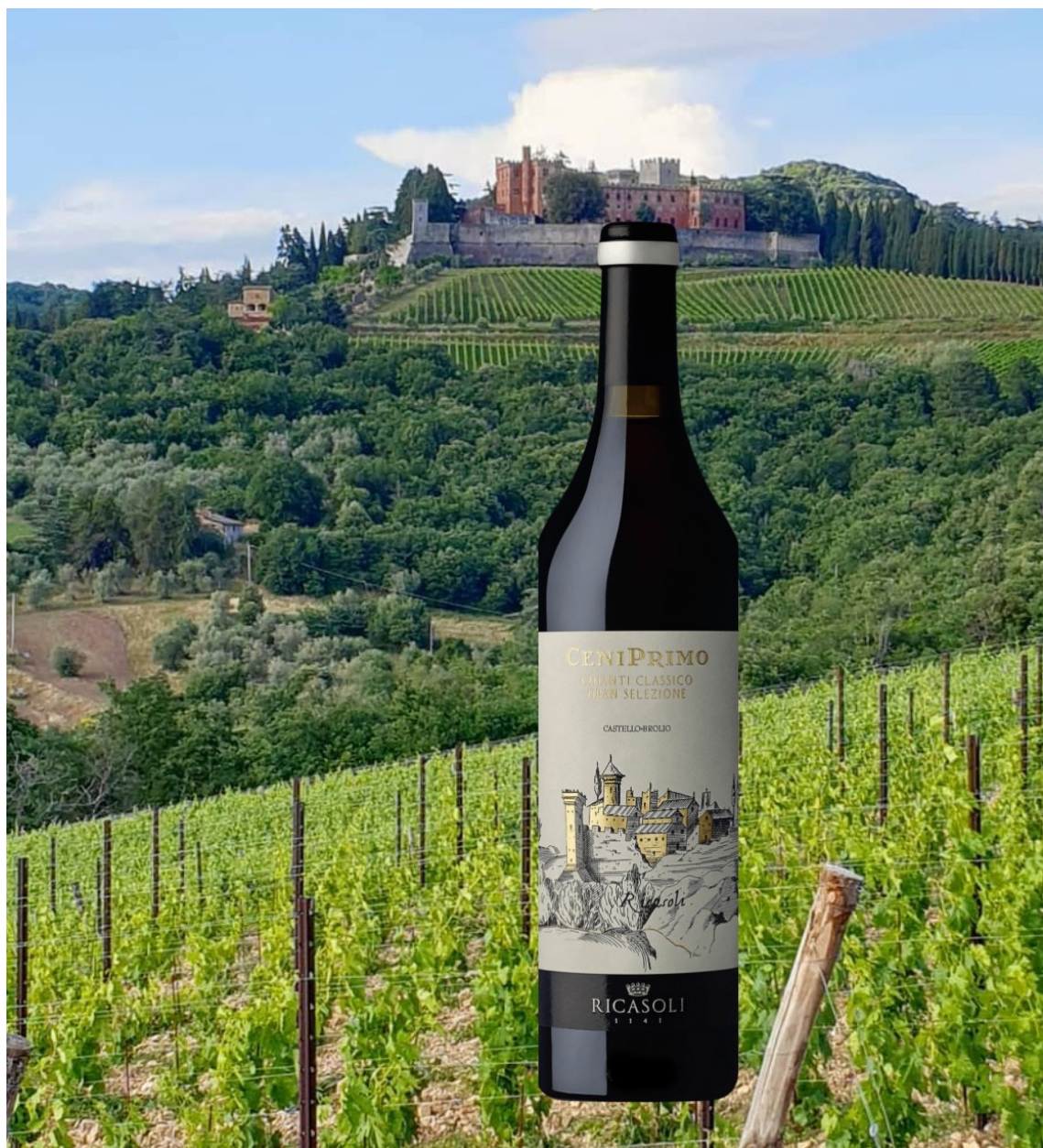
Our top wine from Italy, the Barone Ricasoli Chianti Classico Gran Selezione Ceniprimo 2018, set amid the Ricasoli family's Castello di Brolio estate.